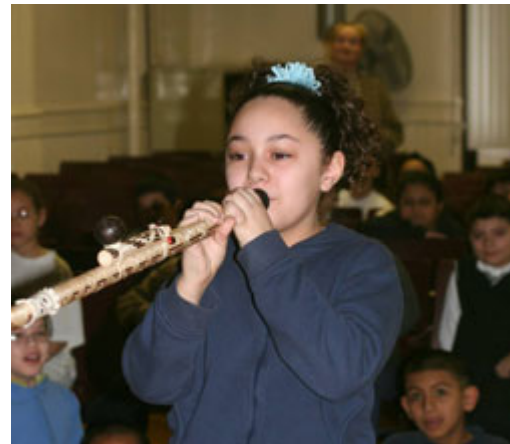
A student demonstrates how to use a traditional hunting tool called a blow dart gun during a presentation about the Amazon Rainforest.

Plus, students will learn how their lives are connected to the world's rainforest by the foods students eat, products they use, and even the air they breathe.