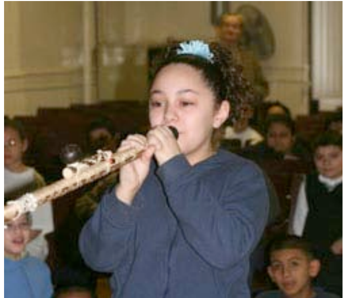
A student demonstrates how to use a traditional hunting tool called a blowgun during a presentation about the Amazon Rainforest.

Plus, students will learn how their lives are connected to the world's rainforest by the foods students eat, products they use, and even the air they breathe.